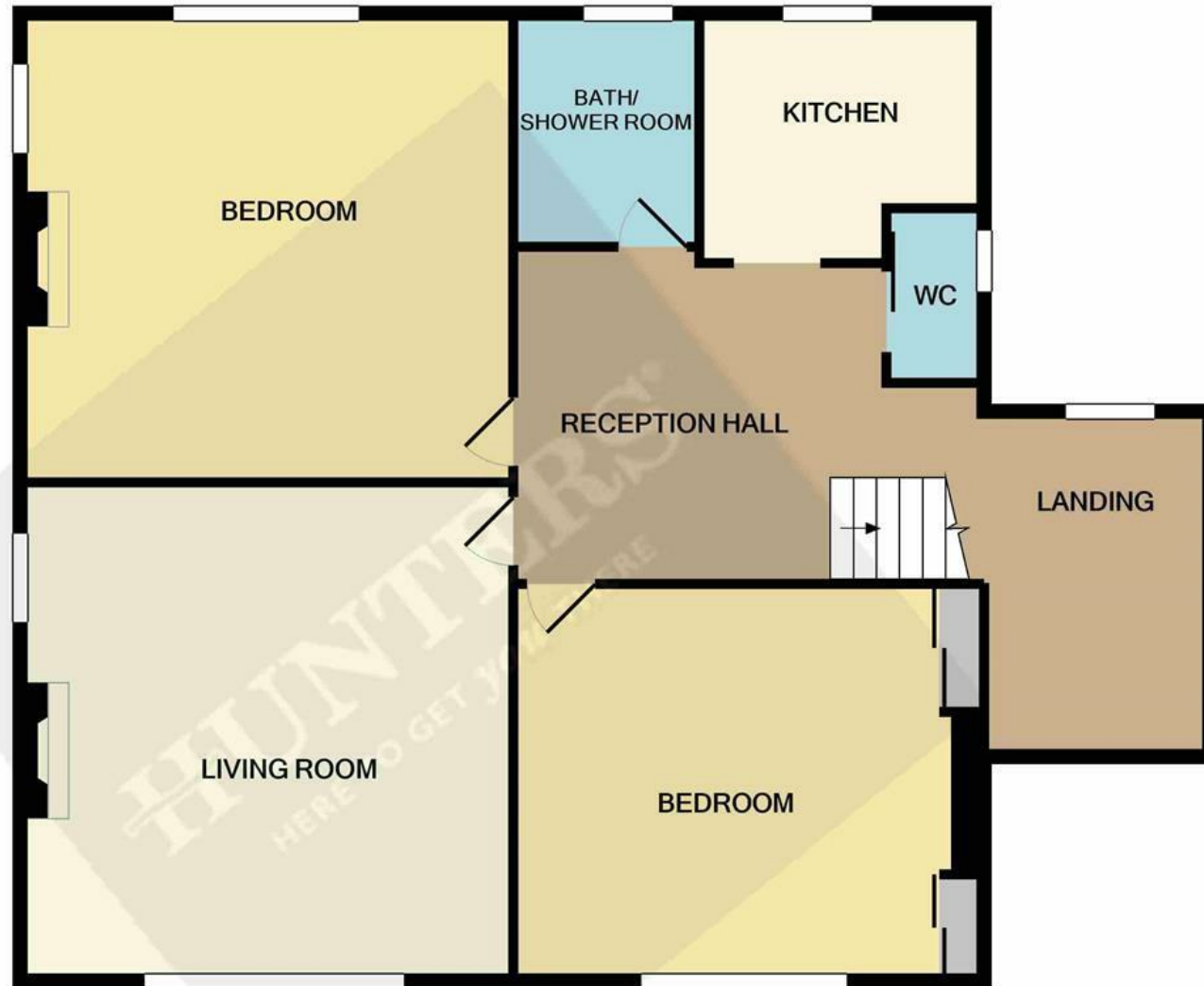
1ST FLOOR APPROX. FLOOR AREA 1048 SQ.FT. (97.4 SQ.M.)

TOTAL APPROX. FLOOR AREA 1182 SQ.FT. (109.8 SQ.M.)